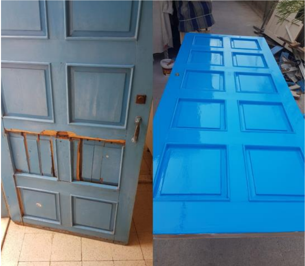
Before and After - Beneficiary's entry door