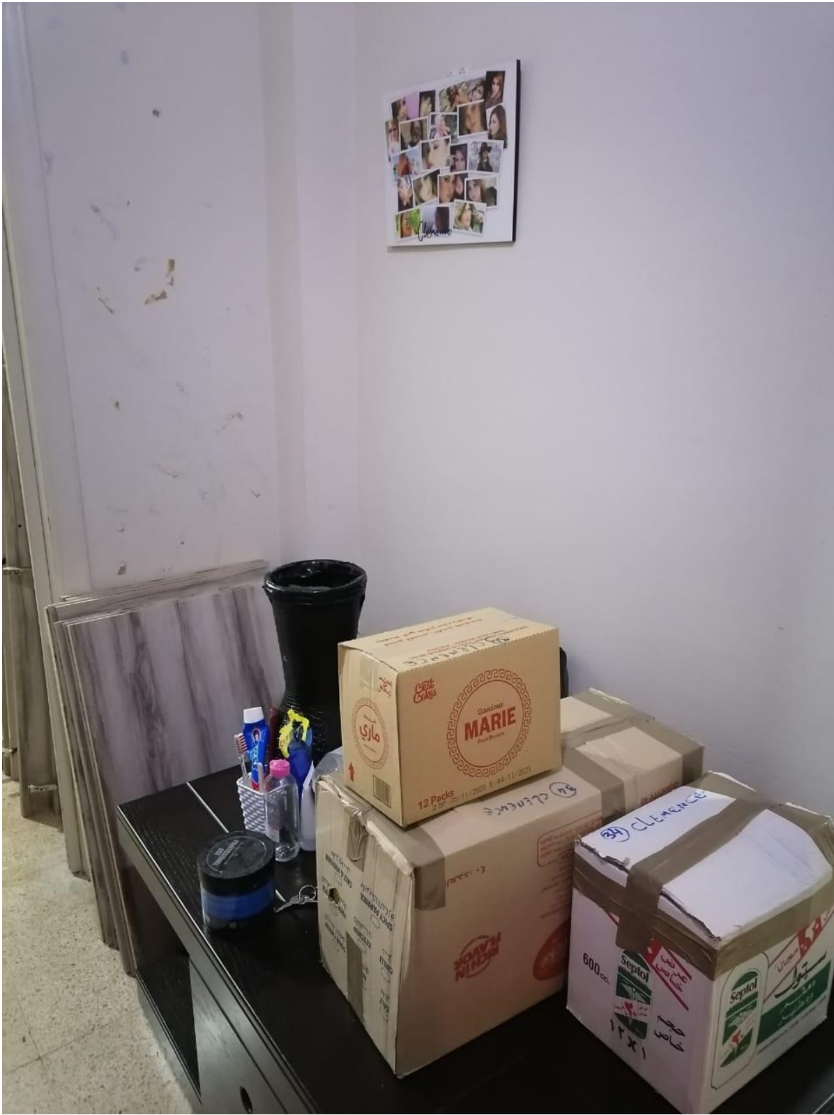
Food boxes distribution