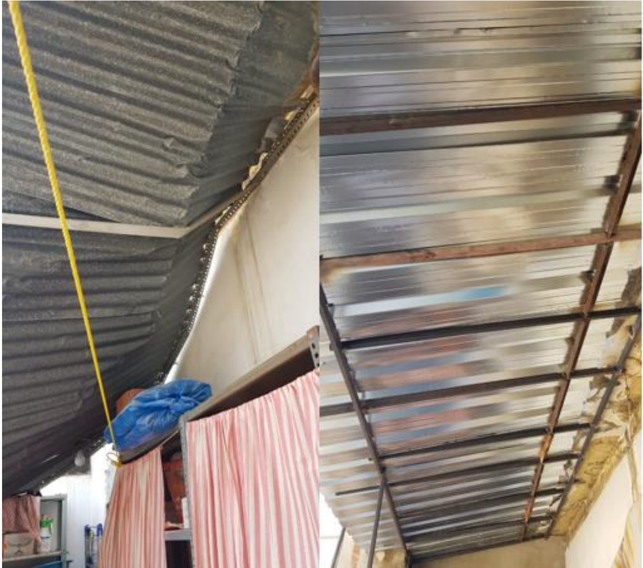
Before and After – Beneficiary's balcony roof